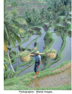
oher-Peter Adams, Photographer

A. The Royal Thai Survey Department - The Royal Thai Survey Department (RTSD) is a major producer of map data of Thailand with the produced map data forming a