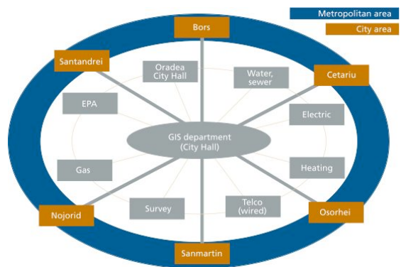
Oradea Municipality schema diagram for GIS Local Consortium initiative

Prior to the commencement of the project, there was a lack of regional and national standards with critical information for development owned by different actors, leading to an inefficient uncoordinated approach. The initiative is meeting both European and international standards through INSPIRE and the Open Geospatial Consortium. The expected benefits at the end of the project include more effective geospatial cooperation between key organizations; metropolitan data and workflow integration; readily accessible, up-to-date geospatial information; and multi-criteria scenarios to support decision making within a standards-based approach. The enhanced decision making will also benefit the bottom line through cost and time efficiencies.